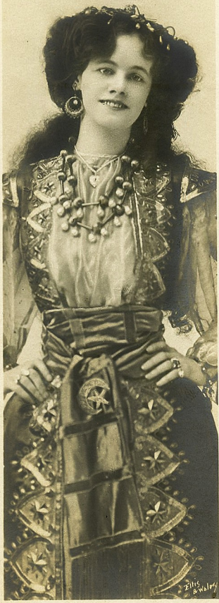
5031 MISS GERTIE MILLAR.